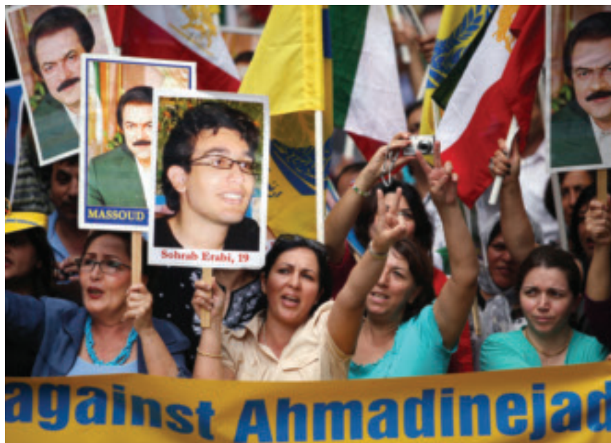
Iranians hold signs and shout slogans denouncing Iranian President Mahmoud Ahmadinejad as they protest near the United Nations headquarters in New York during Ahmadinejad’s speech to the General Assembly this fall. Thousands of people rallied against the Iranian government and protested its alleged human-rights abuses following disputed presidential elections in June.