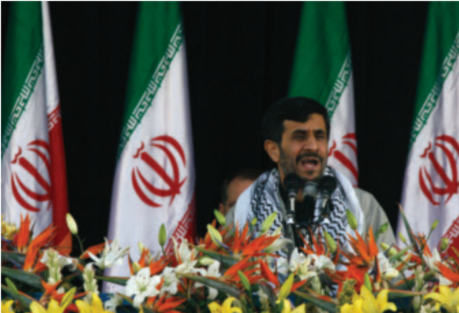
Above: Iranian President Mahmoud Ahmadinejad delivers his speech in a military parade ceremony, celebrating the onset of the Iran-Iraq war (1980-1988), in front of the mausoleum of the late Ayatollah Ruhollah Khomeini.