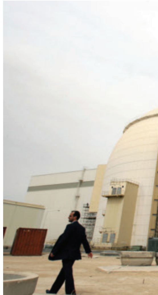
Right: A staff member walks past the main building of the Bushehr nuclear power plant near the southern Iranian port city of Bushehr. Iranian and Russian engineers carried out a test run of Iran's first nuclear power plant in February, a major step toward starting up a facility that the United States once hoped to prevent because of fears over Tehran's nuclear ambitions

I n the spring of 1945, when a liberated survivor of a World War II Nazi death camp was asked what he had learned from his ordeal, he replied, “When someone says he wants to kill you, believe him.” During the holocaust, in what Israeli Prime Minister Benjamin Netanyahu has called the “tragedy of powerlessness,” millions of European Jews walked, obedient and docile, all the way into the gas chambers. This fact painfully permeates the modern Israeli psyche to the extent that it gives rise to a kind of national mantra— never again . Today, it is incomprehensible for those outside Israel to understand how Israelis must be feeling, knowing that there is a new Nazi-like state poised to attempt Israeli annihilation.