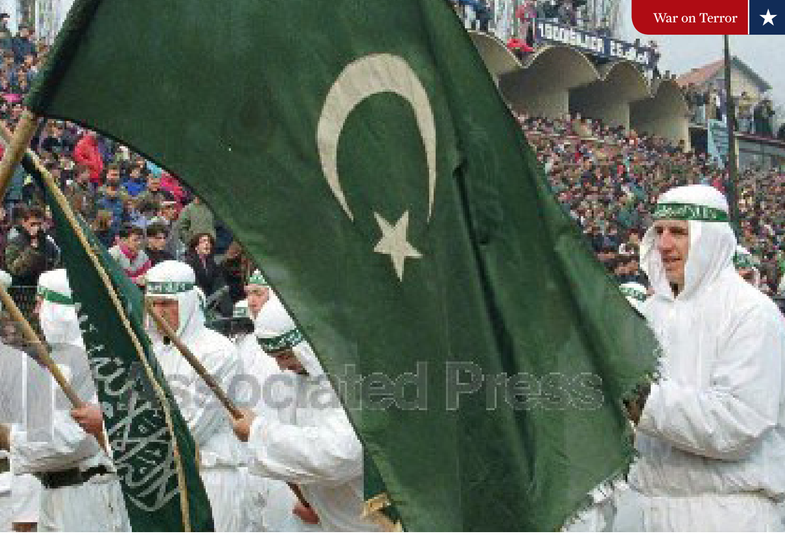
Bosnian Army soldiers wearing the special uniform for those ready to die in the name of Allah carry the Islamic flag during a military parade. The United States and the much of the Western world sided with the Muslim-controlled government and its Islamic army in its fight against Christian Serbs.

Christians. At a fixed date, every father had to gather his sons in the main square of the local village and allow the authorities to select the best to be sent away ... resistance brought instant death ... some fathers disfigured their sons to prevent their enslavement."