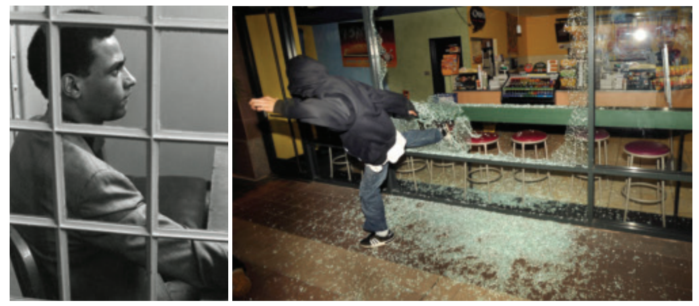
Lef : Black Panther leader Huey Newton gazes from a jail cell on the IOth floor of the Alameda County Courthouse in Oakland, Calif., July I8, I968. Newton was on trial for a white policeman's slaying.

Right: A man smashes a café window during a January 2009 riot in Oakland, which has tragically become one of the most dangerous cities in the country. The violence followed a protest in support of shooting victim Oscar Grant and included dozens of smashed car windows and more than I5 shattered storefront windows.